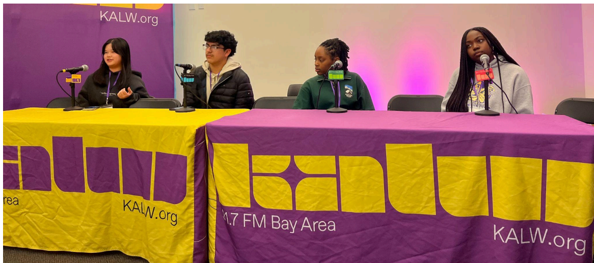
Youth commissioners speaking on a panel about Oakland Youth Vote in San Francisco at local radio station KALW.

On February 11, the Youth Commission was invited to speak on a panel at San Francisco's public radio station, KALW, to share an overview of our campaign and advice for other youth interested in trying to pass youth vote in their cities.