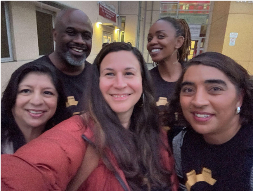
CTE Hub Coalition leaders pictured after a school board meeting on September 19, 2024 after securing support from the School Board to move forward with plans demolish the site at 1025 2nd Ave to begin construction on the Hub.