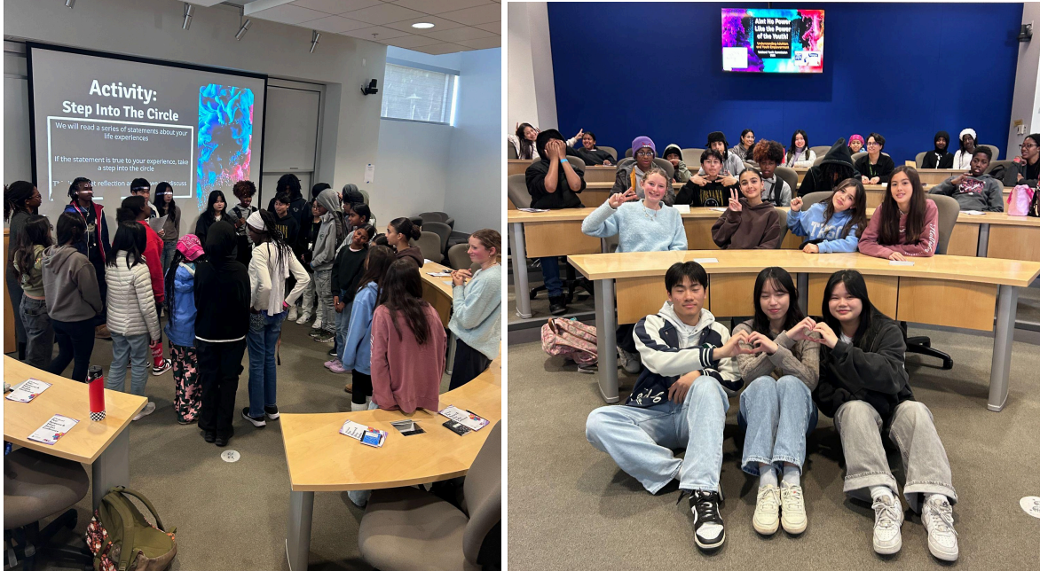
Youth commissioners lead OUSD Middle School students at the annual ACC Ethnic Studies Conference in March 2025