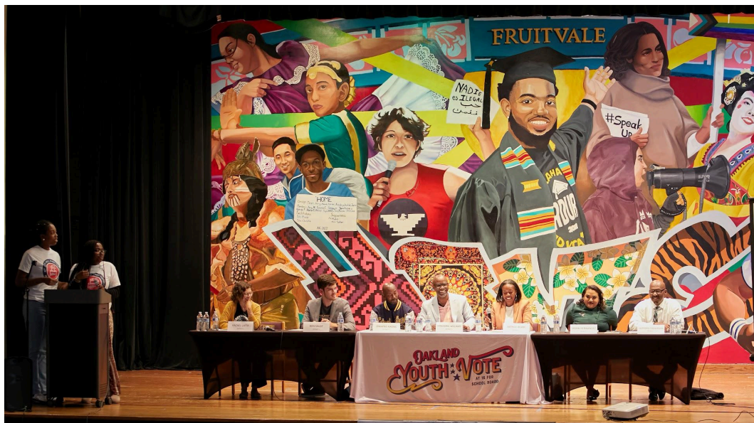
Youth MC's (left) ask questions to school board candidates for Districts 1, 3, 5 and 7