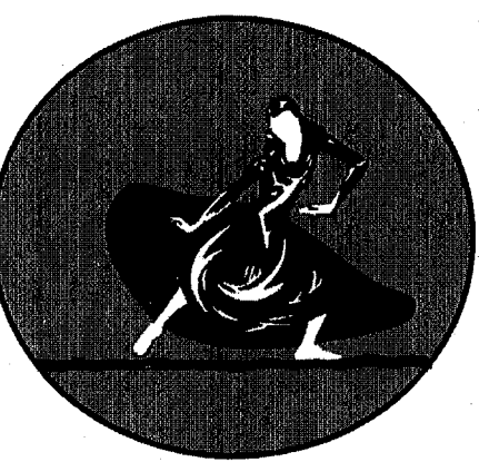
64 Special events in parks or rec centers