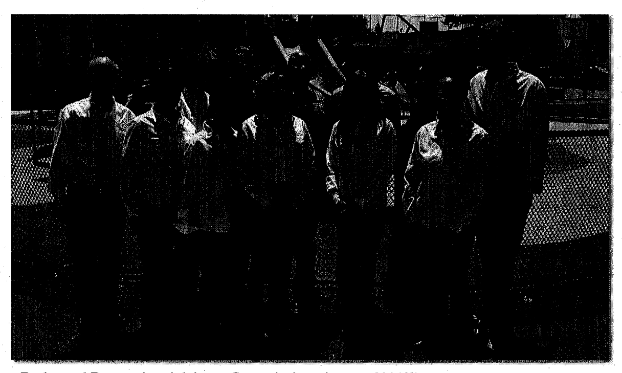
Parks and Recreation Advisory Commission, August 2016(*)

There is much to be done. PRAC stands ready to assist the Mayor and City Council as Oakland faces new opportunities and challenges in the coming year.