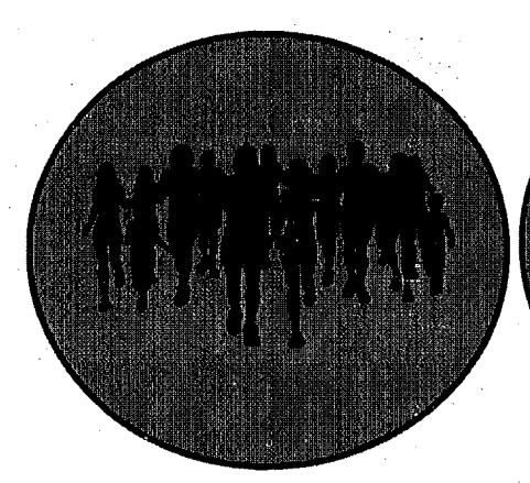
Fundraising walks around Lake Merritt