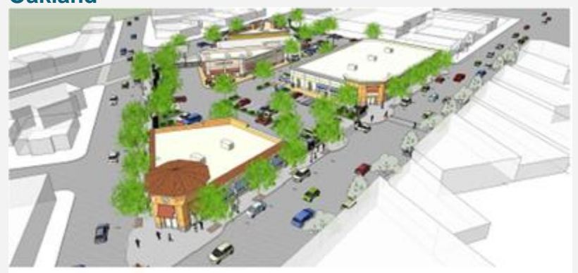
Proposed design at intersection of Foothill Boulevard and Seminary Avenue

The City of Oakland and <u>Sunfield Development</u> are putting the final touches on Seminary Point, a 26,950-square-foot commercial project at the intersection of Foothill Blvd. and Seminary Ave. Anchored by Walgreens, Seminary Point is scheduled to open later in 2017 and has <u>leasing opportunities</u> available for other retailers and local businesses. In addition to land and tax credits, the City has invested in major public streetscape improvements along Foothill Blvd. and Seminary Ave.and provided façade and tenant improvement grants for area businesses. Seminary Point is <u>one of several catalytic East Oakland development projects</u> nearing or under construction, including <u>Lucasey Lofts</u>, <u>Derby Lofts</u>, <u>3014 Chapman St</u> and the <u>Coliseum Transit Village</u>. For more information, contact Urban Economic Coordinator Theresa Lopez.