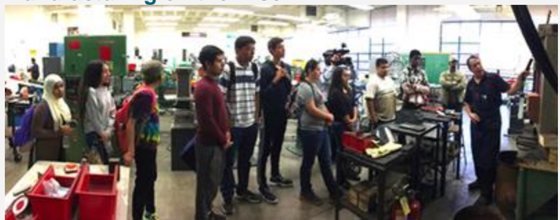
Fremont High students taking a tour on Manufacturing Day