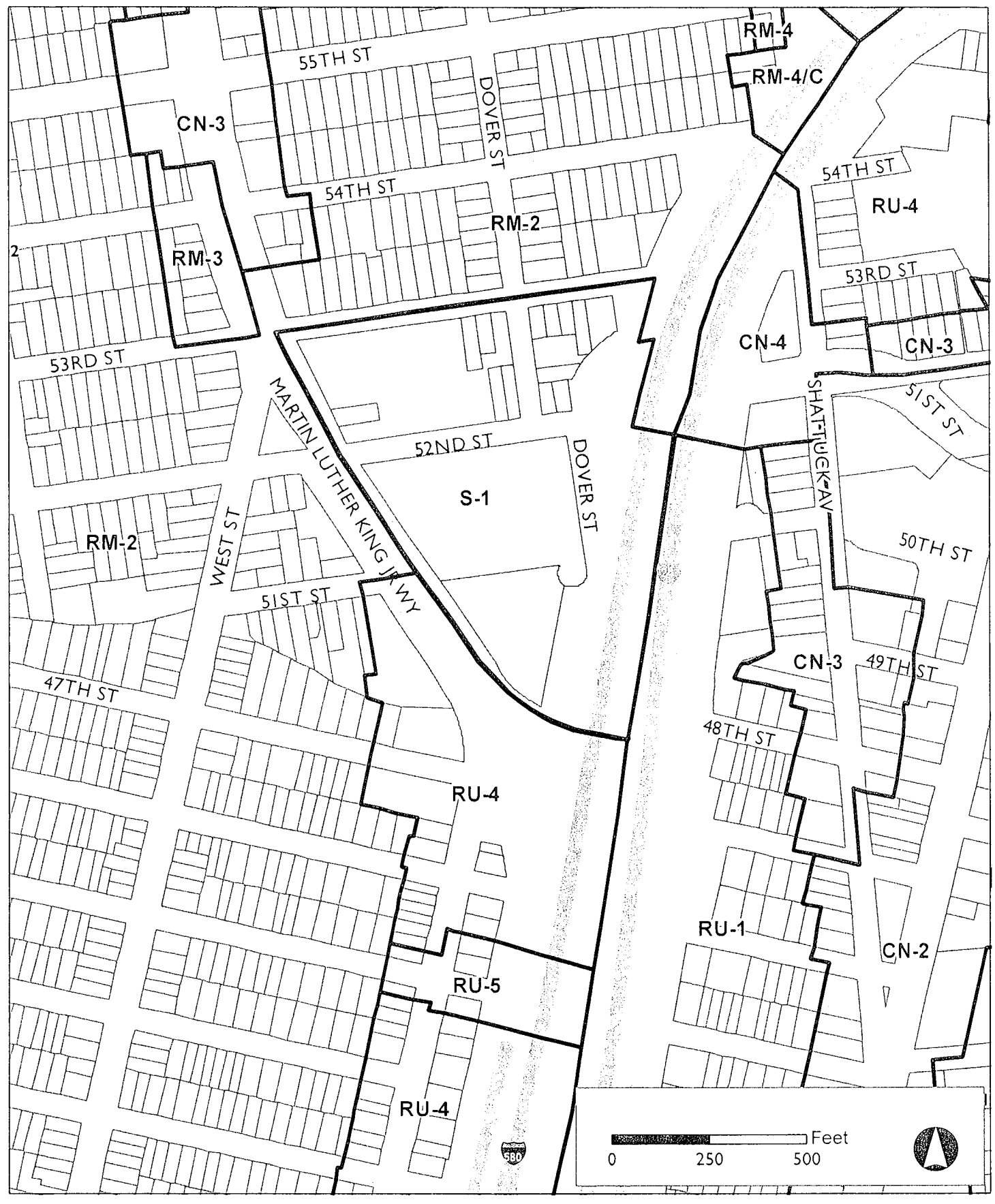
Planning & Building Department April 29, 2015 (corrected)