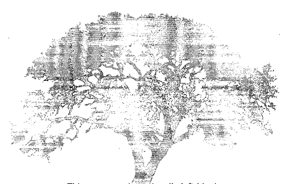
This page was intentionally left blank.