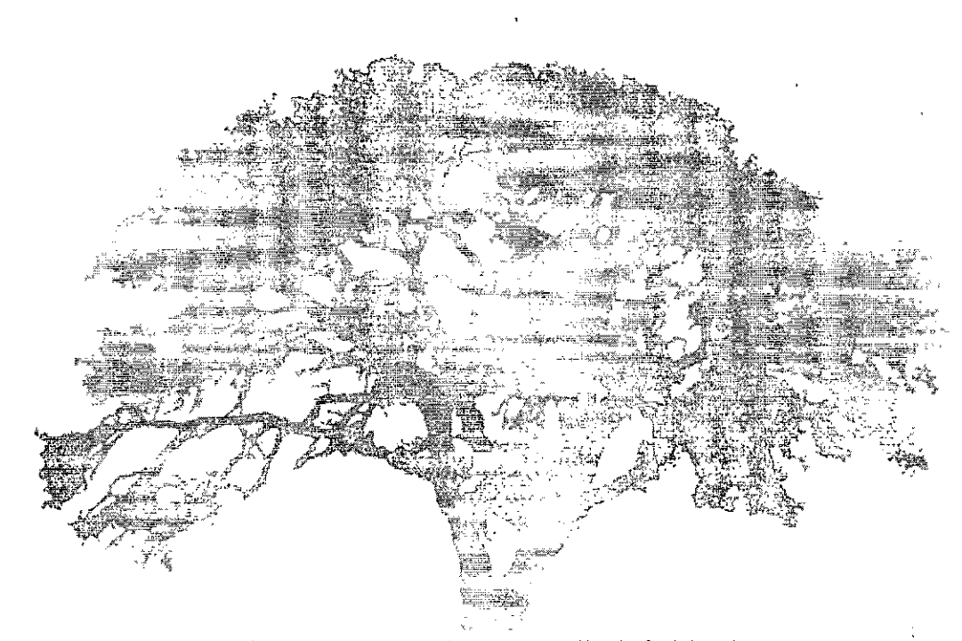
This page was intentionally left blank.