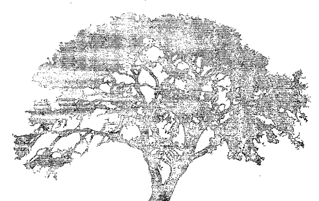
This page was intentionally left blank.