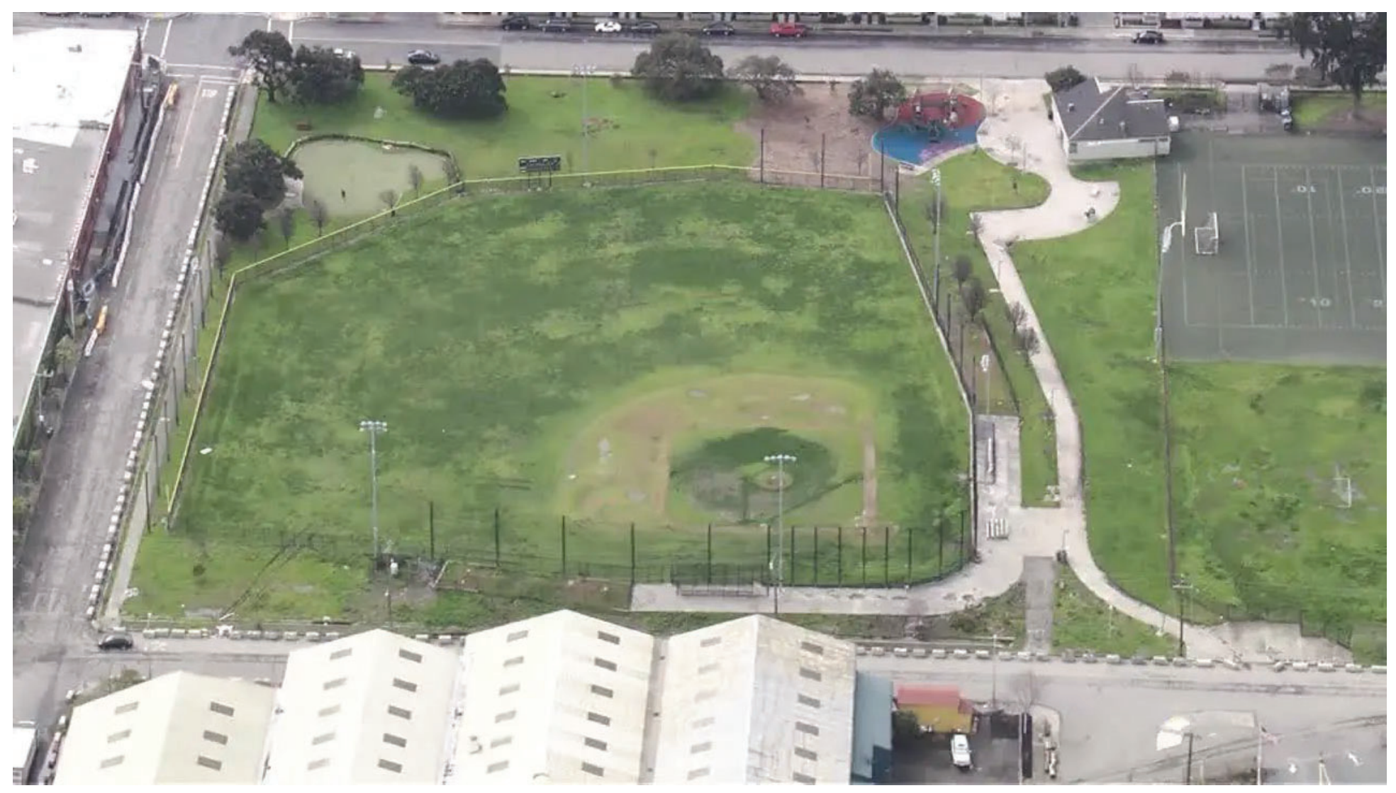
City Council April 16, 2024