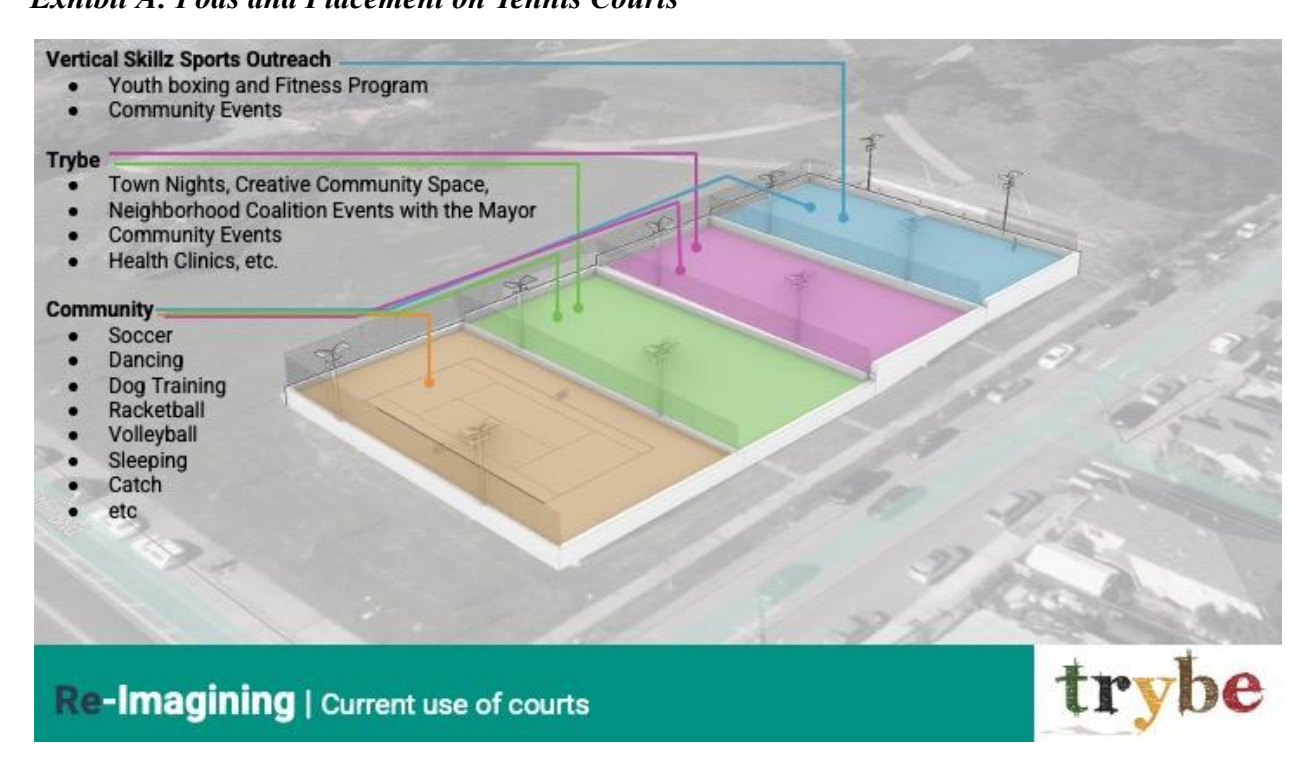
Exhibit B: San Antonio Park Tennis Court Programming Vision