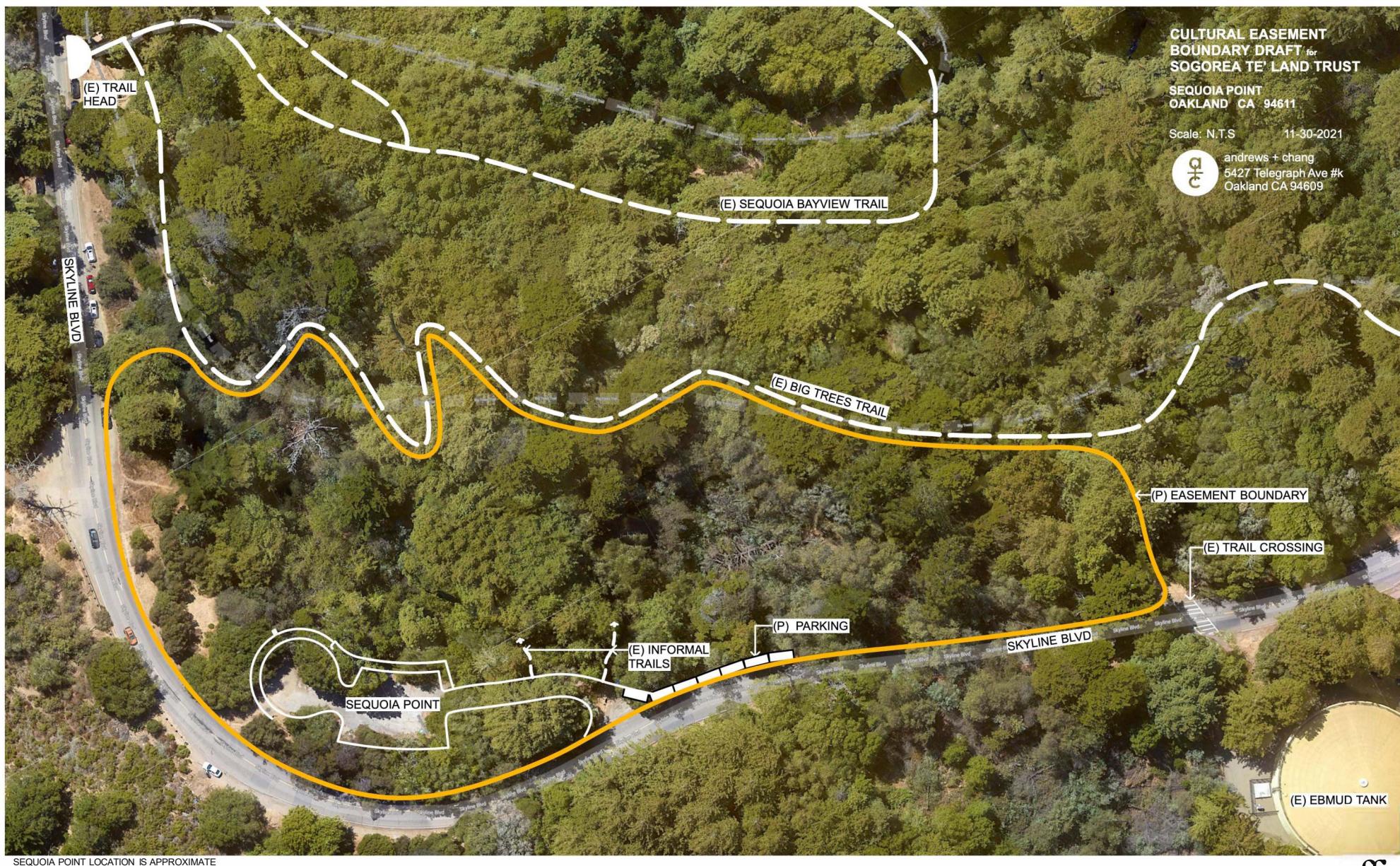
TRAIL LOCATIONS BASED ON JOAQUIN MILLER PARK TRAIL MAP BY THE FRIENDS OF SAUSAL CREEK. LOCATIONS ARE APPROXIMATE.