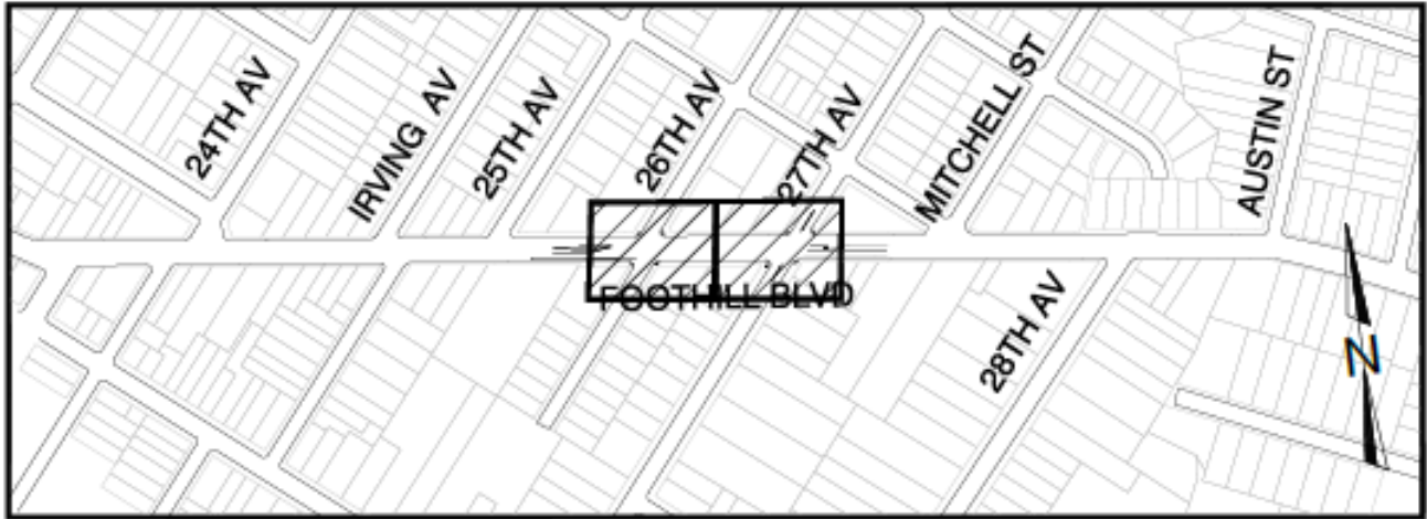
FOOTHILL BLVD & 26TH AND 27TH