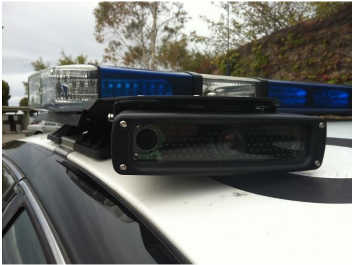
Figure 1: OPD ALPR Patrol Vehicle Camera System

The ALPR Impact Report ( Attachment A ) explains that: