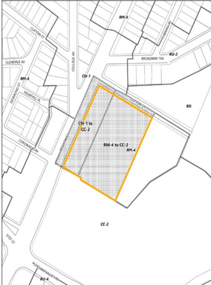
EXHIBIT A MAP 1 Proposed Zoning Change