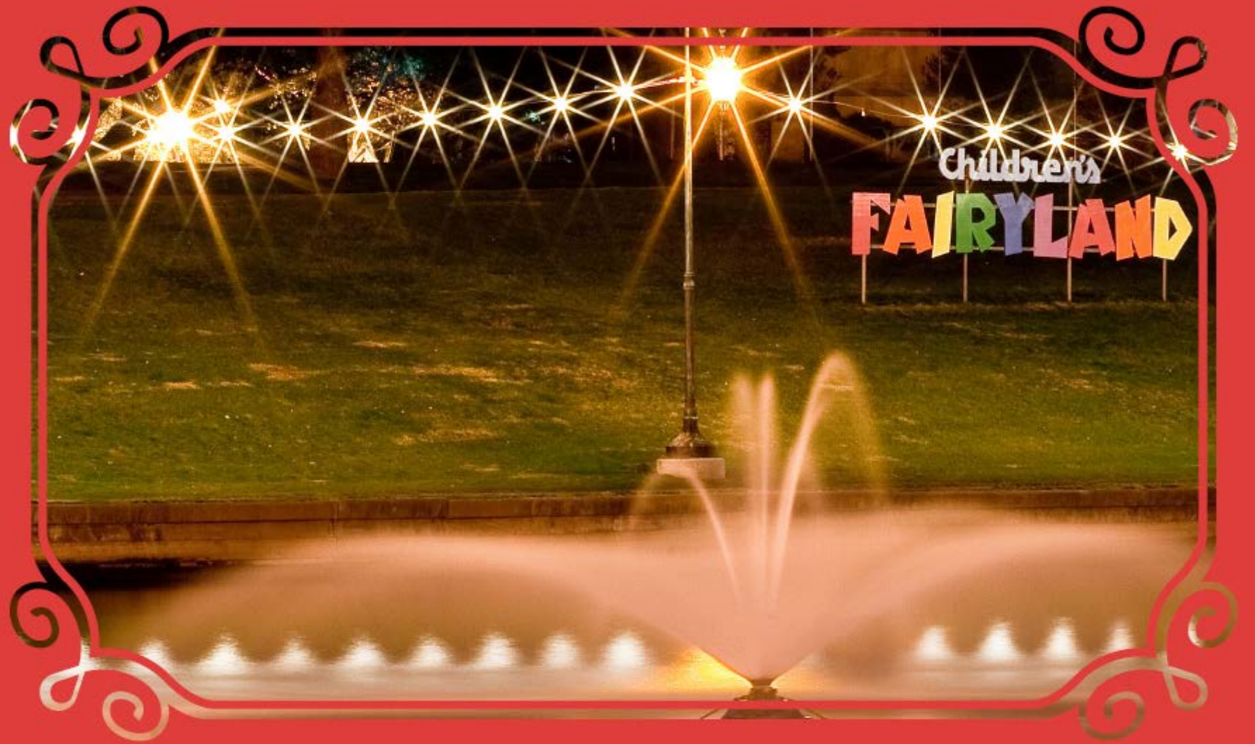
An Oakland Treasure on the Shores of Lake Merritt