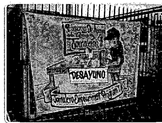
Banner for Day Laborer Breakfast Program.