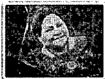
Nobel Peace Prize winner Rigoberta Menchú speaks at a Homies Empowerment event.

Homies Empowerment is a youth development program for gang-impacted and gang-involved youth based out of Oakland, CA. This program directly involves itself with issues that affect our community. Our goal is to create a positive and revolutionary change through programs that are primarily run by youth who bang for freedom .