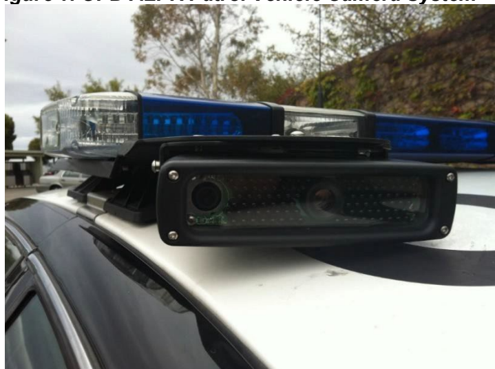
Figure 1: OPD ALPR Patrol Vehicle Camera System

Figure 1 below is an image an OPD patrol vehicle equipped with two ALPR cameras: an infrared (IR) camera and a color-image camera in a single housing. There are two camera units per vehicle equipped with ALPR technology. The cameras use IR as well as OCR to read the plates so that the OPD ALPR database can be queried for alpha-numeric characters.