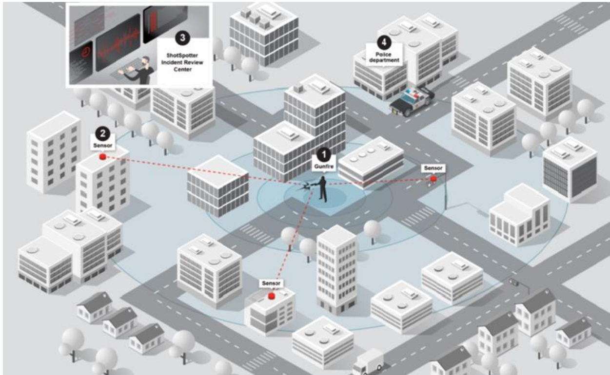
Figure 1 – How the ShotSpotter System Works

ShotSpotter provides near-instant notifications to officers of gunshot crimes in progress with real-time data delivered to OPD Communications Section and patrol vehicles. Officers can use their vehicle computers for real-time access to maps of shooting locations and gunshot audio. Between ShotSpotter data and communications with OPD dispatch, patrol personnel also receive actionable intelligence detailing the number of shooters and the number of shots fired; this type of information is incredibly important for officer safety. The system pinpoints precise locations for first responders.