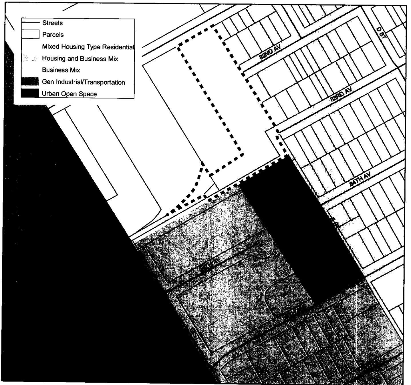
EXHIBIT C AMENDMENT TO GENERAL PLAN LAND USE DIAGRAM