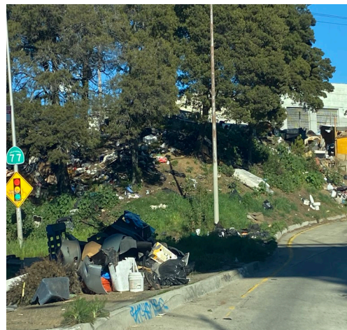
Illegal dumping @ 42 nd Ave and International Blvd (Caltrans property at Hwy 77)

OPW recommends continuing the subcontracting arrangement with BC for this work. Currently, OPW also contracts with BC to remove litter and bulky debris near and in active homeless encampments because the nonprofit has demonstrated success at engaging unsheltered residents in detailed micro-cleaning at encampments and consistently producing remarkable results. Through the City's contract with BC, Oakland can increase the nonprofit's capacity to hire more unhoused and justice-involved individuals. Participants will be paid above the living wage and given job skills to transition to stable employment, which improves economic security for this population and benefits the community at large. Council approval of the proposed resolutions will demonstrate the City's responsiveness to Oaklanders' appeals to do more to clean up Oakland streets.