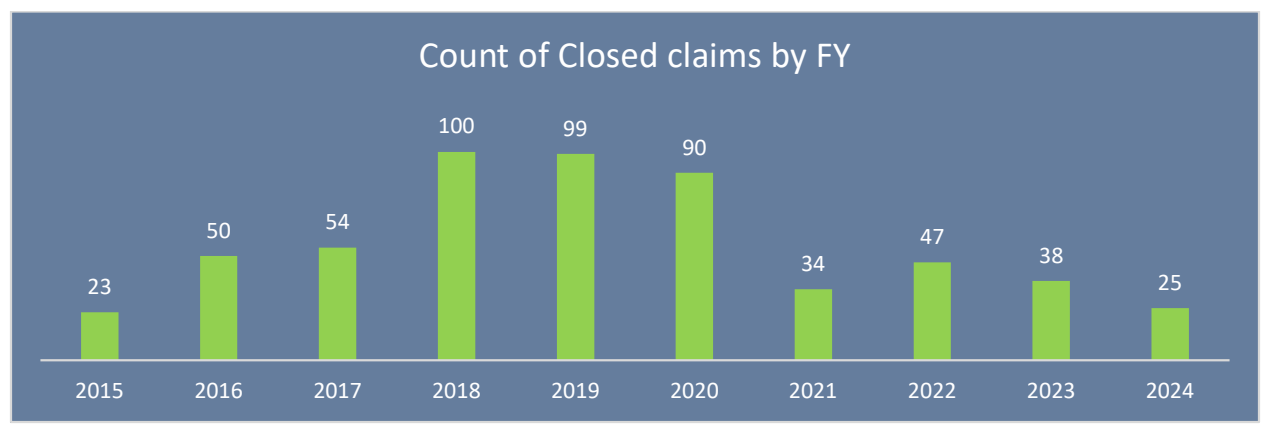
Total Closed Claims by Year