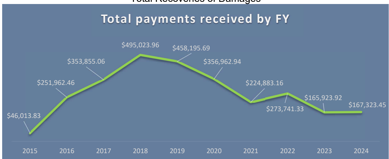
Total Recoveries of Damages