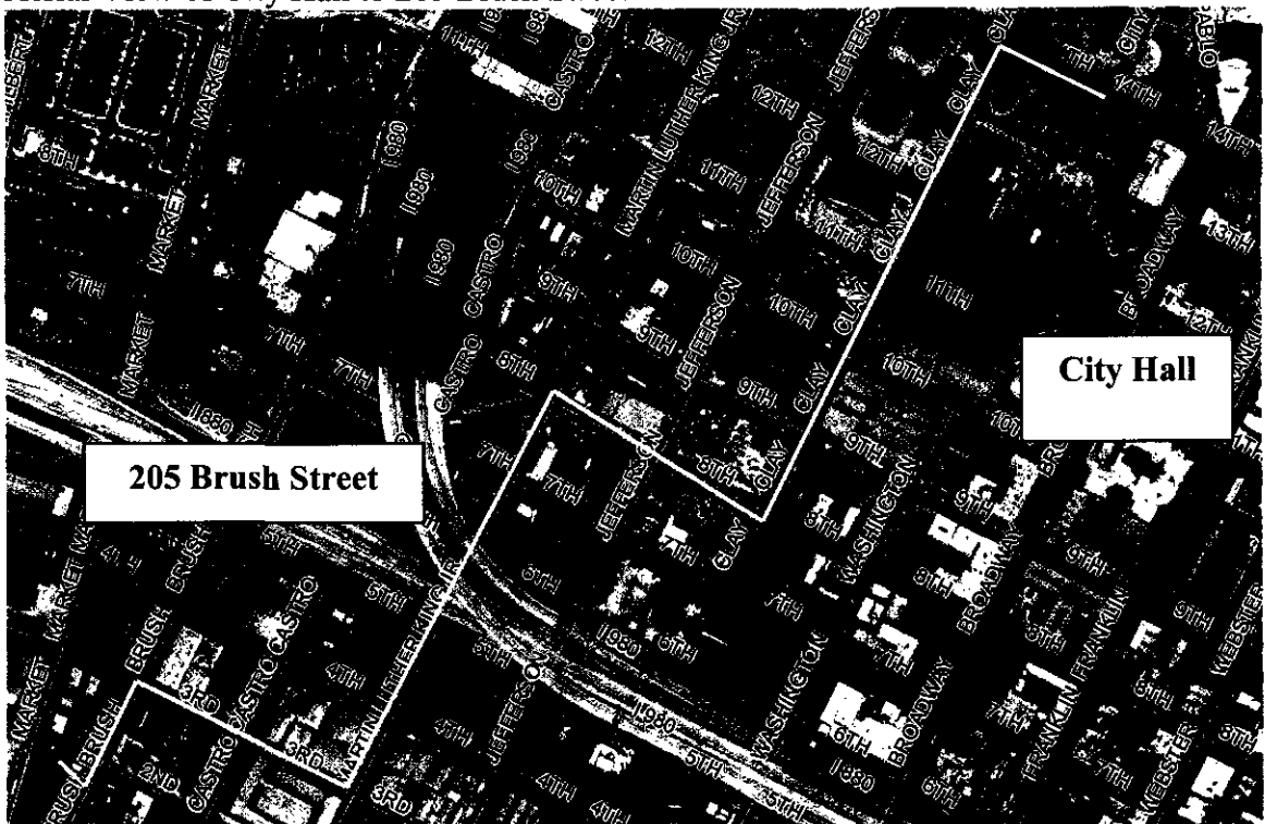
Aerial View of City Hall to 205 Brush Street