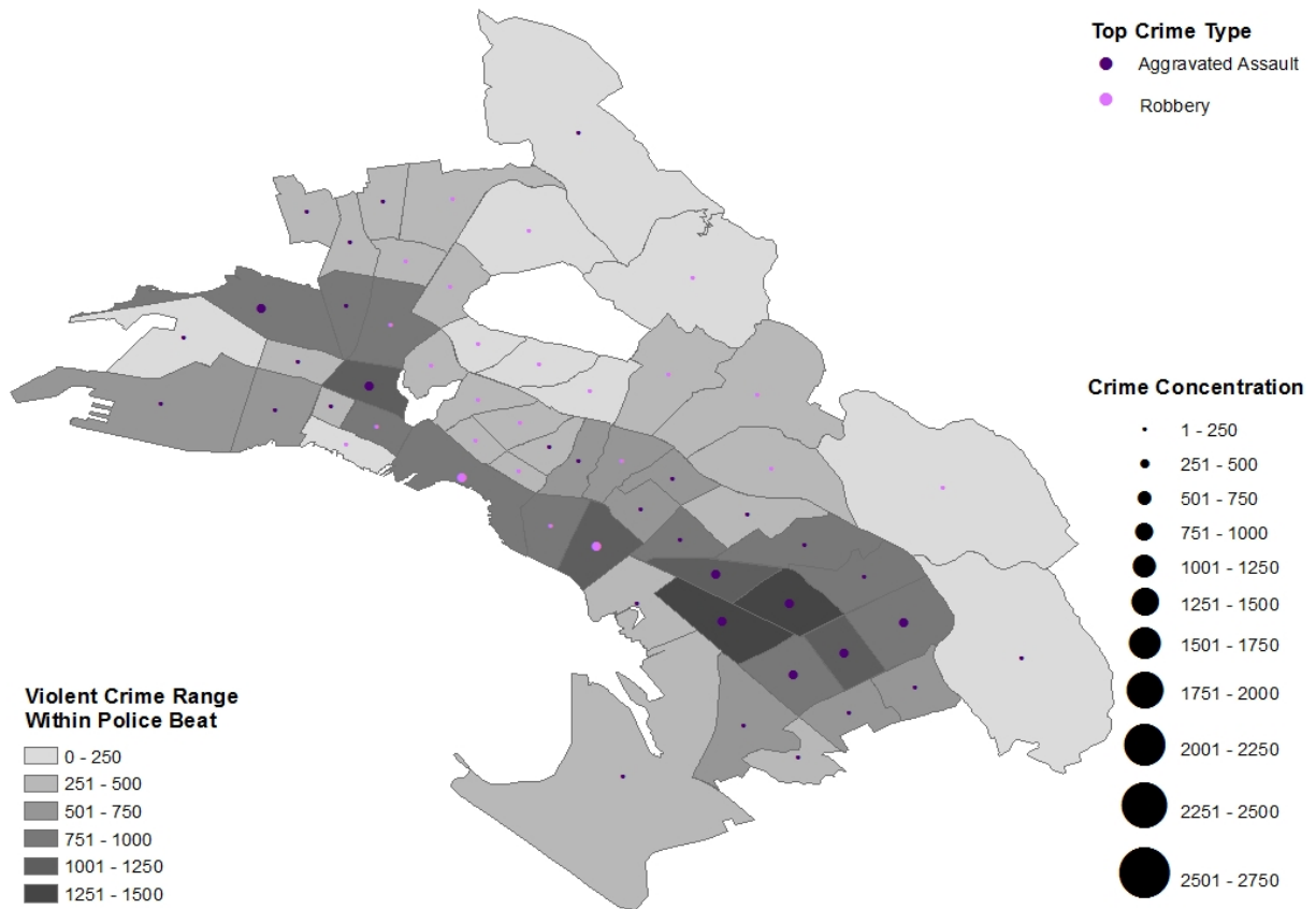
Figure 2. Map of All Violent Crime and Top Violent Crime Across All Police Beats 8

Differences in prioritizing activities not only creates a lack of clarity as to how CRT and CRO officers address local concerns within their assigned area, but it also impacts their efforts to build relationships with community members. The majority of community members interviewed for this project perceived OPD as unresponsive to their needs that are deemed as not life threatening. This lack of response to less serious, violent crimes, such as theft or burglary, makes community members feel as though OPD does not care for their well-being.