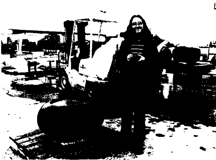
Scale of Exhibit Stone