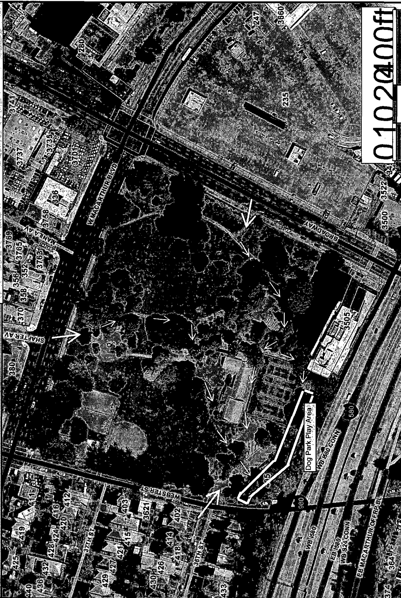
Exhibit A - Mosswood Park Designated Hardscape Permitting Dogs On-Leash