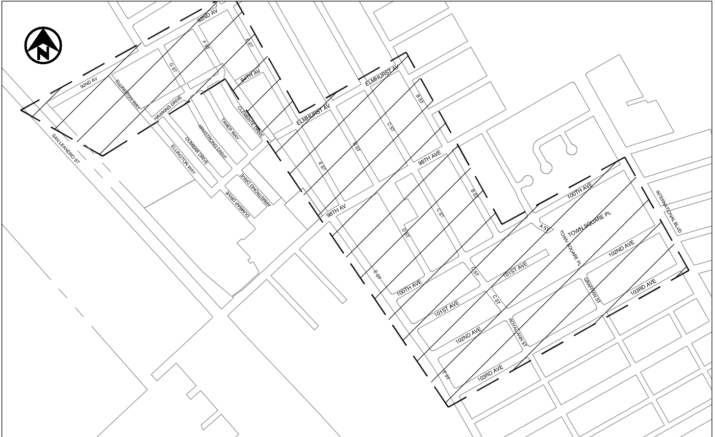
LOCATION MAP 1