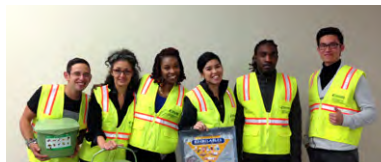
Ambassadors to Assist with Resident Outreach