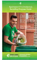
Recycling Brochure in English, Spanish, Chinese or Vietnamese