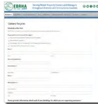
Request Onsite Service Evaluation