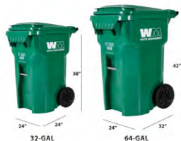
Compost Collection Carts Arrive in June