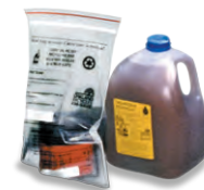
Free Motor Oil Recycling Kit