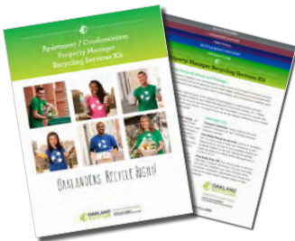
Property Owner / Manager Tool Kit