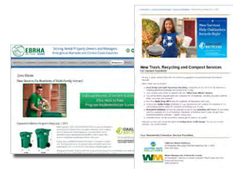
Download & Customize Resident Communications