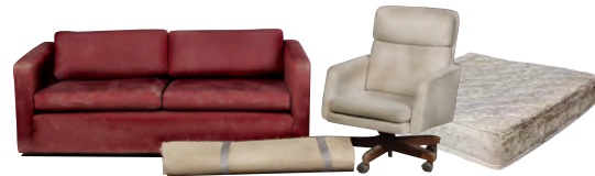
New Bulky Collection Program