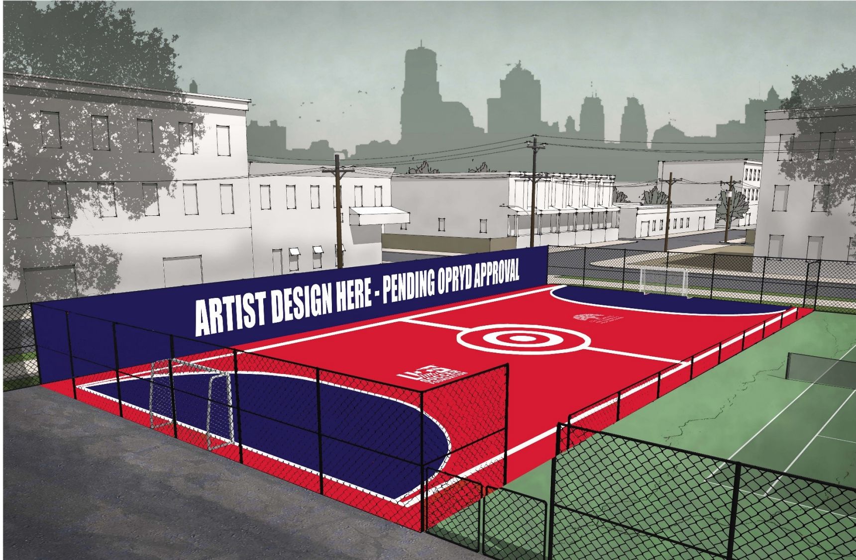
Concordia And Patterson Park Mini-Pitch Soccer Gift-In-Place