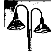
Lighting fixture - 1-1-1 fixture size 1/2" fixture by GESCO pole height +25' H/P