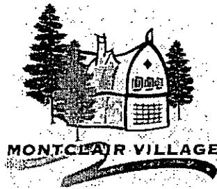
EXHIBIT A (to the Resolution of Intention to Levy the 2009/10 Montclair BID assessment)