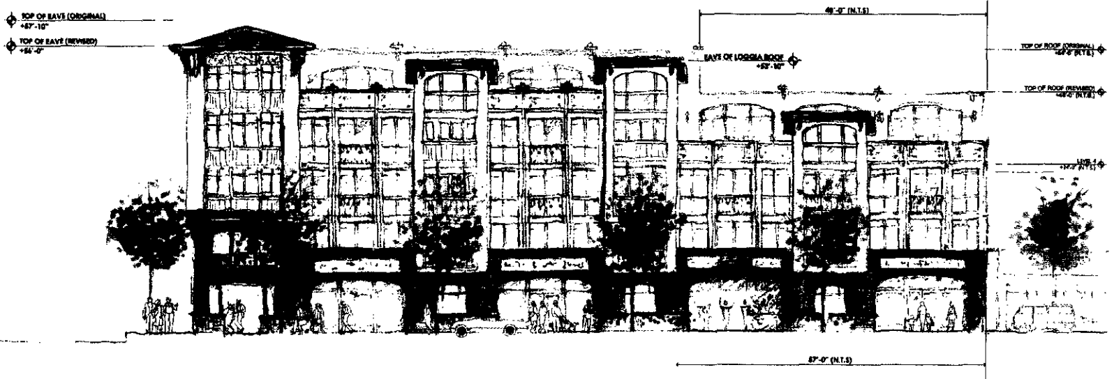
SCHEME 1A SCALE: 1/16"=1'-0" (APPROXIMATE)