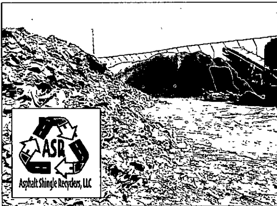
Scrap shingles become recycled asphalt for roads, reducing landfilling, GHGs, and cost.

"Oakland is central to the Bay Area and major transportation options," said Fookes. "It is also home to thousands of residential properties with 1 to 4 units, which are typically roofed with asphalt shingles."