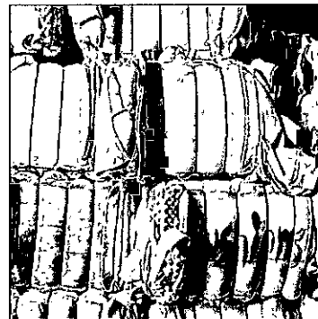
DR3 workers separate and recycle over 90 percent of material from more than 10,000 mattresses per month.

dling fees, rebuilding and reselling the highest quality mattresses, and selling recycled commodity materials.