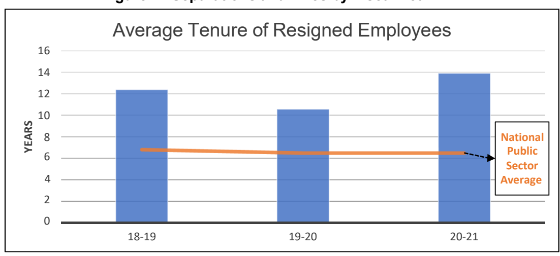
Figure B: Separations and Hires by Fiscal Year

2. Tenure of Separations : According to the Bureau of Labor Statistics, the national rate of tenure with a public-sector employer is 6.5 years (private sector is 3.7 years), which includes all separations. Over the last three years, all separated full-time City of Oakland employees average 12.28 years of service, far surpassing the national average. See Figure B below: