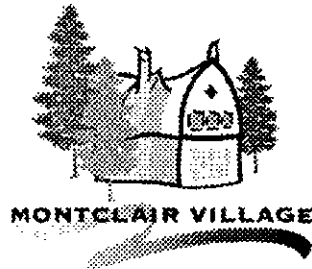
EXHIBIT A (to the resolution of intention to approve the Montclair BID annual report and levy the FY 05/06 assessment)