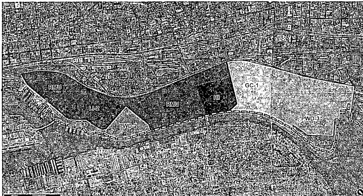
Existing EPP Land Use Designations