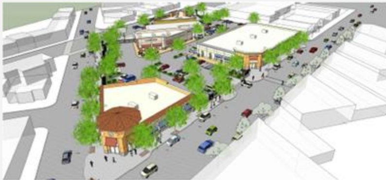
Proposed design at intersection of Foothill Boulevard and Seminary Avenue

The City of Oakland and Sunfield Development are putting the final touches on Seminary Point, a 26,950-square-foot commercial project at the intersection of Foothill Blvd. and Seminary Ave. Anchored by Walgreens, Seminary Point is scheduled to open later in 2017 and has leasing opportunities available for other retailers and local businesses . In addition to land and tax credits, the City has invested in major public streetscape improvements along Foothill Blvd. and Seminary Ave. and provided façade and tenant improvement grants for area businesses. Seminary Point is one of several catalytic East Oakland development projects nearing or under construction, including Lucasey Lofts , Derby Lofts , 3014 Chapman St and the Coliseum Transit Village . For more information, contact Urban Economic Coordinator Theresa Lopez .