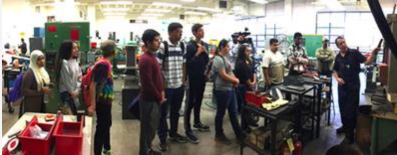
Fremont High students taking a tour on Manufacturing Day