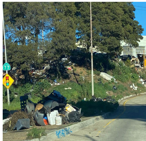
Illegal dumping @ 42 nd Ave and International Blvd (Caltrans property at Hwy 77)

OPW recommends contracting with Beautification Council to perform the work on Caltrans property. Currently, OPW contracts with Beautification Council, a local non-profit and community-based organization, to remove litter and bulky debris near and in active homeless encampments. Beautification Council is uniquely qualified to perform this work. The organization has demonstrated the ability to engage unsheltered residents in detailed micro-cleaning at encampments, consistently performing above standard. Through the City's contract with Beautification Council, Oakland can amplify the community-based organization's ability to hire more unhoused and justice-system-involved individuals to perform the work. Participants will be paid above living wage and given job readiness skills to transition to stable employment, which improves economic security for this population and the community at large. Council's approval of the proposed resolutions will demonstrate the City's responsiveness to Oaklanders' appeals to do more to clean up Oakland streets.