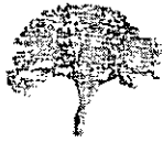
EXHIBIT A POLICE SERVICES