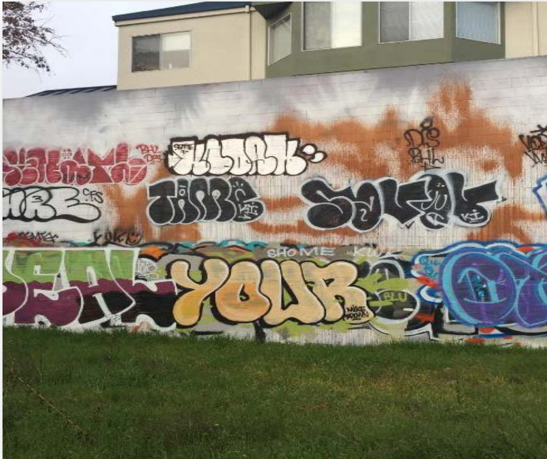
7 th & Campbell St

“Running” is a term that refers to how long a vandal’s graffiti tag (moniker or avatar) can be visible before it is removed.