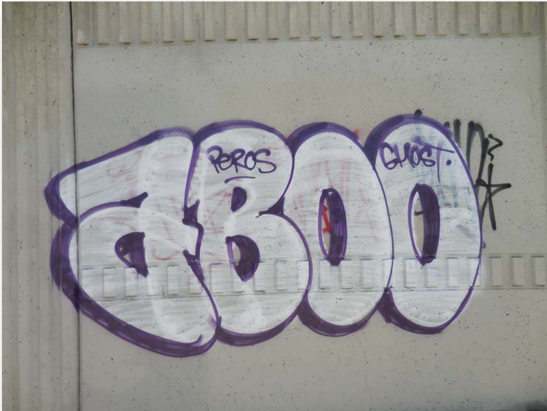
Mac Arthur Blvd. & 35 th Ave.

A graffiti tagger's moniker (or avatar) is the vandal's identification marker or signature.