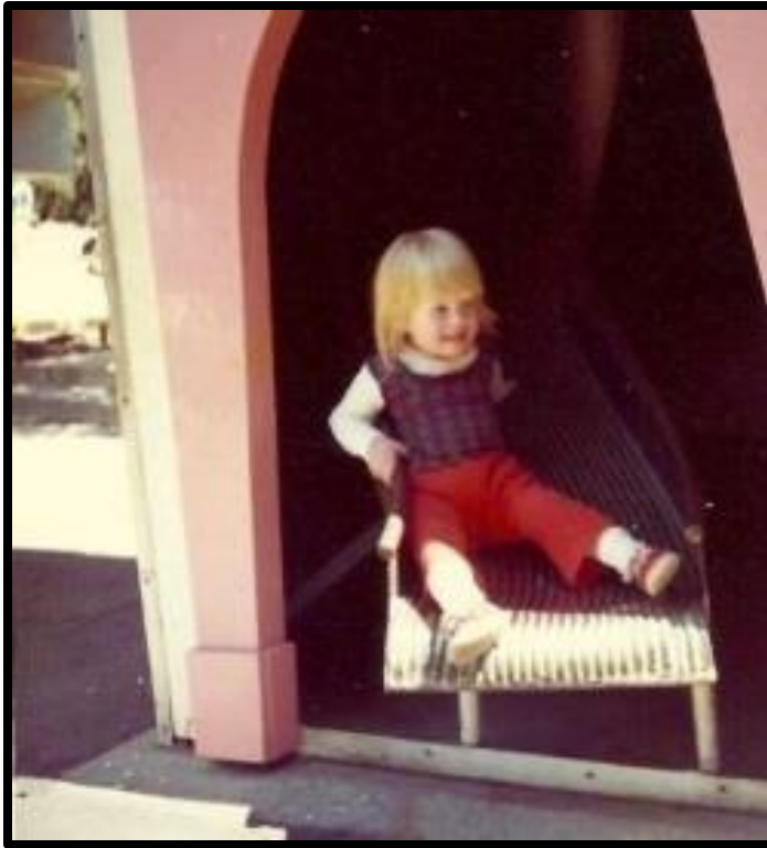
Children's Fairyland, ca. 1973