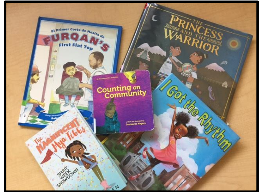
OPL Holiday Gift Guide: #OwnVoices Children's Books