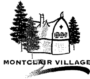
EXHIBIT A (to resolution of intention to levy Montclair BID FY06/07 assessment)